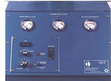
Close-up of control panel

I'm interested in a WOTEC system. Where do I start?