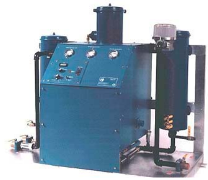
WOTEC model 15s (smallest size and appropriate for most communities).

The WOTEC systems essentially turn used oil into brand new fuel that you can use right then and there!