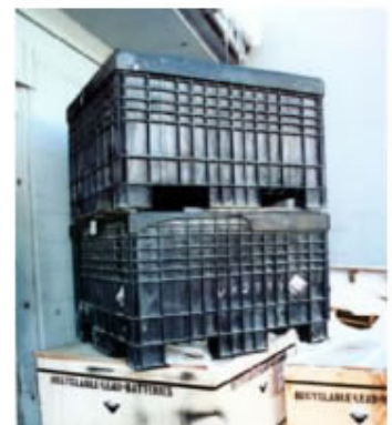
Example of plastic totes that can be used to ship batteries