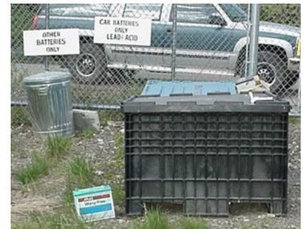
Plastic fish tote that can be used to ship batteries

If your community can't afford to purchase these containers, the good news is that you can apply for a Special Permit from DOT which allows you to use regular plastic fish totes to ship batteries (like the photo to the right). Note that if you are shipping batteries by barge , the regulations are less strict - you don't need a permit, and you can package batteries on wooden pallettes (shrink-wrapped) or plastic boxes/totes.