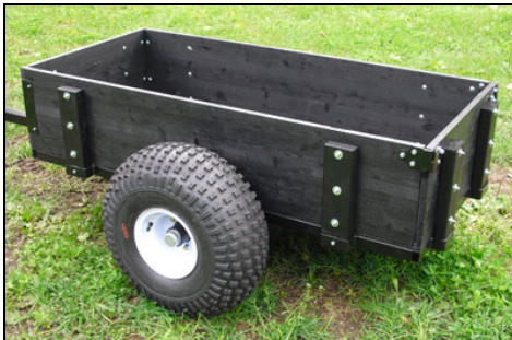
BM 1500 Flatbed Trailer

Below are 2 models. Last Frontier also will work with you to design and fabricate a custom trailer to suit your specific requirements and specifications.