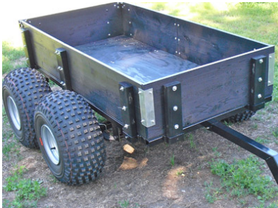
BM 3500 Tandem Flatbed

7/8 coupler 22x11x8 tires 2x4 stake pockets packs flat for shipping