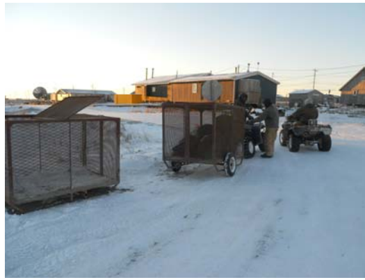
Hooper Bay using "trash transport system"

Stationary bins measure: Height 60" Length 74" Wide 48"