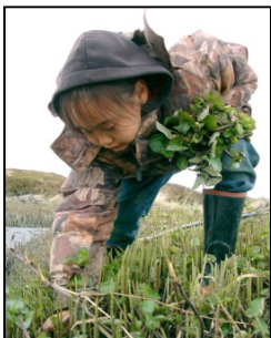
Gathering greens from the tundra.