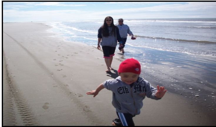
Young people walking on beach in Hooper Bay. We need to protect our beaches and waterways for all generations to come...doing this is Environmental Justice.