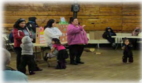
Presenting at a Community Wellness Event

$21,743.00 to carry out their proposed project. Huslia's approach of public education, and locally-built, lower-cost community bins demonstrates how a more affordable trash collection program can be achieved, and how it can reduce poor in-town practices such as barrel burning. Interested? Read on!