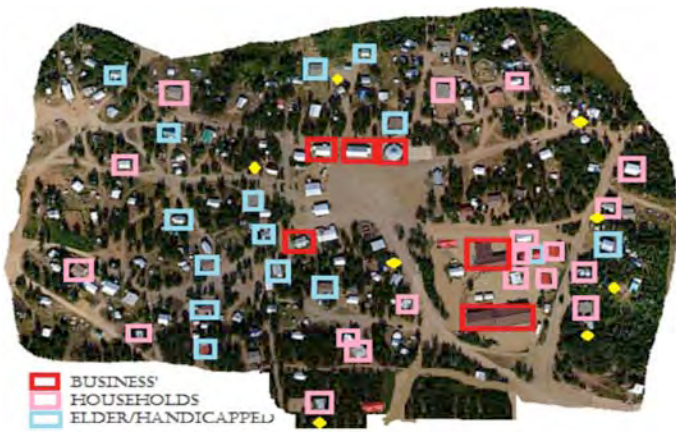
Map showing paying customers helps to determine best bin location and whether it needs to be changed.

due to a busy time period for the Environmental Program. The number of households paying for the service dropped to 44%. That is actually still a great number – it means that if you can afford door prizes and a lot of education for a year, you can get folks so used to the collection service, most of them will keep paying (called a “behavioral change”) !