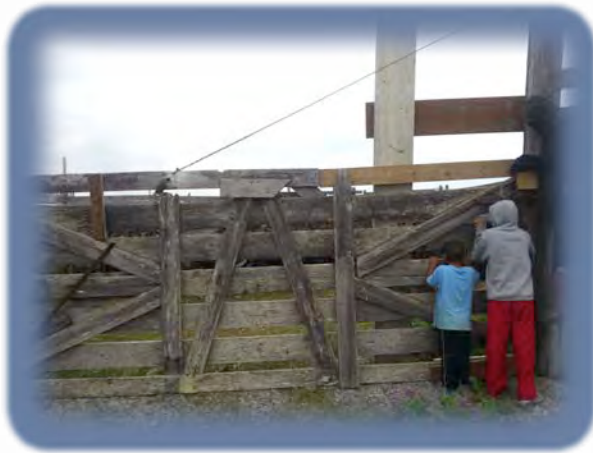
Watching the Reindeer Herd After a Successful Corral On Norton Sound

Hi everyone! Once again, this Fall we're looking at no snow across a lot of Alaska. Unlike last year, temperatures are warm, not cold. It is allowing a lot more work on construction and other projects - many of which had to start late this year due to the late snow. Living in rural Alaska villages means to always be prepared, and to be prepared even for times that give you more time to prepare! Now that barge season is gone for nearly all of us, are you looking for a project to start while waiting for more snow and a hard freeze-up? We hope this issue gives you some ideas. We