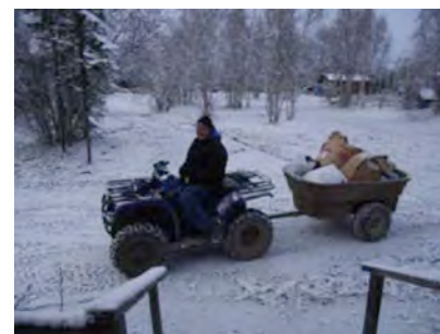
Dedicated ATV and Trailer Purchased with CEDP Award

Post-Project Update: We have an even better post-project update! It's been one and one-half years since their project started, and six months since it ended. The continued anti-burning education-- together with