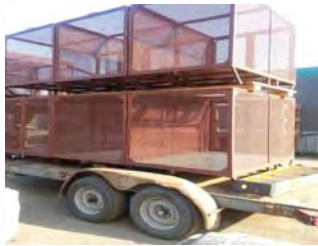
Trash bins on their way from Tok

Hooper Bay was awarded a grant to start a community trash collection program from RurALCAP's new Solid Waste Management grant program for YK Delta villages.