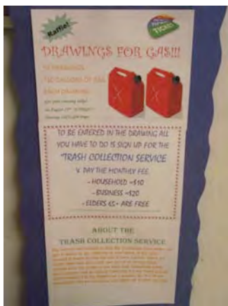
Monthly Raffle Poster to Encourage Signup.