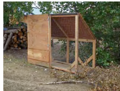
Above: Constructing Bins and Below: Completed Trash Bin