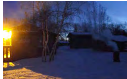
Barrel Burning In Town

Using a shared community bins system, versus house-to-house collection, reduces the labor and operational costs for a collection program. The