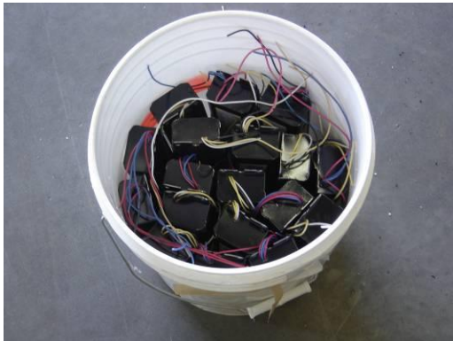
Vertical layer of ballasts