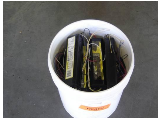
Horizontal layer of ballasts